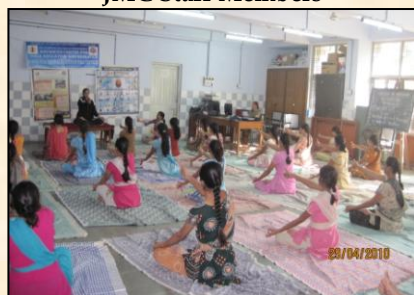
Camp at Nursing College