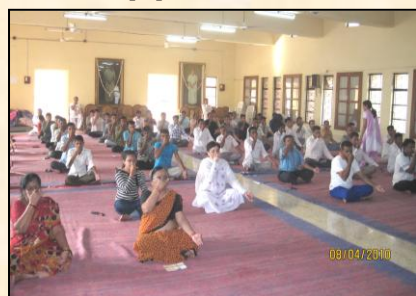
JMC Staff Members