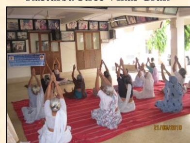
Old Age Home