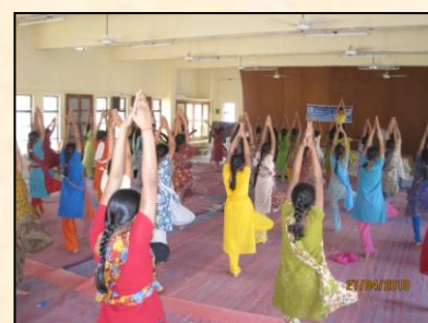
Kasturba Stree Vikas Gruh